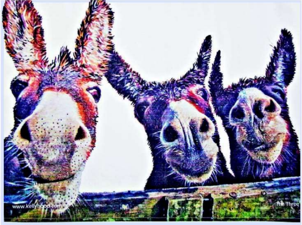
'The Three Amigos' - tea towel design by Kelly Hood